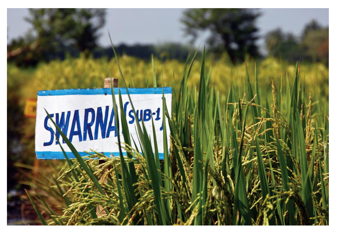
A field of Swarna Sub1 rice growing in India.

This project evaluates the impact of introducing the Swarna-Sub1 rice variety in the Indian state of Odisha. In this region, rice is a staple food and risk of flooding is high. Low levels of fertilizer use are characteristic of flood-prone areas of India.